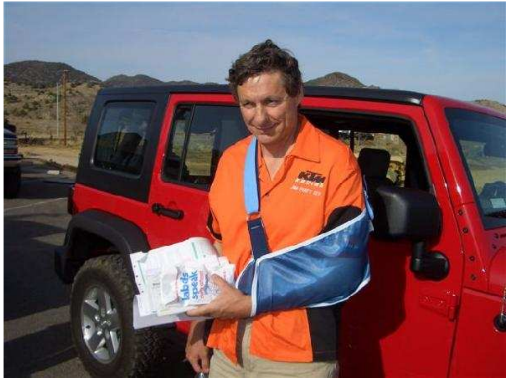
What really hurts is wearing this KTM shirt!!