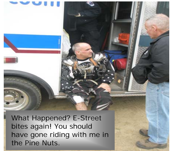
What Happened? E-Street bites again! You should have gone riding with me in the Pine Nuts.