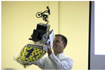
What a happy guy!!! Now his wife knows where all his money went.