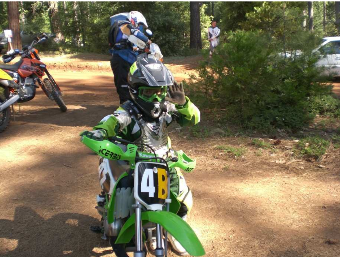
Ready, Set, Go!